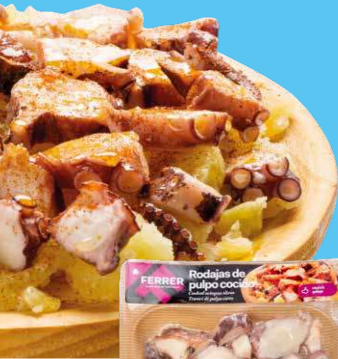
4294 Cooked octopus slices 7x250g | NDW: 200g Tranci si polpo cotto

All our mixes and salads are our own production and made with the finest ingredients. Very practical and healthy varieties that allow you to make many dishes quickly, easily and very tasty.