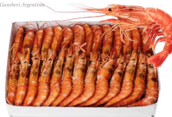
2255 "Mar de plata" prawn

2051 | N° 2 | 20-30 un./kg | 6x2kg | NDW: 2kg 2052 | N° 3 | 30-40 un./kg | 6x2kg | NDW: 2kg Gamberi Argentina