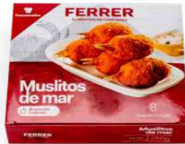
8053 Breaded surimi crab claws 8 un. | 16x250g Surimi del mare