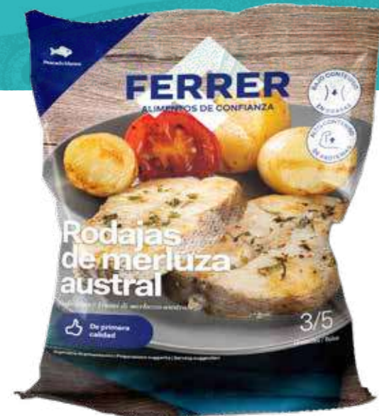
4168 Austral hake slices 3-5 un. | 8x600g | NDW: 500g Fette di merluzzo australe