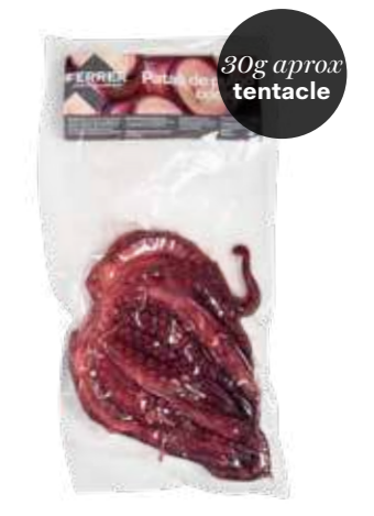
10247 Cooked octopus tentacles T-7 8 tent. | 10x180-280g/case Delizia di polpo