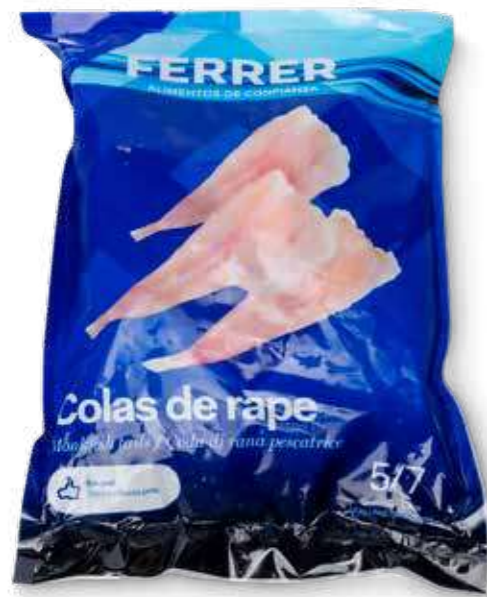
Monkfish tails 2284 | 5-7 un. | 150-200 g/un. | 6x1kg | NDW: 800g 2283 | 4-5 un. | 200-300 g/un. | 6x1kg | NDW: 800g Code di coda di rospo pacifico