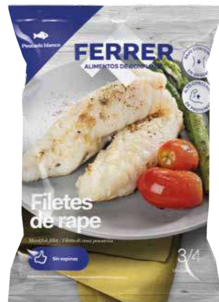
2297 Monkfish fillets 2297 | 3-4 un. | 15x400g | NDW: 360g Filetti di rana pescatrice