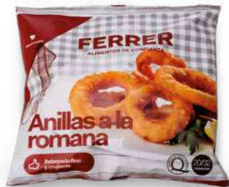
4110 Batter-fried squid rings 20-32 un. | 10x400g Anelli alla romana