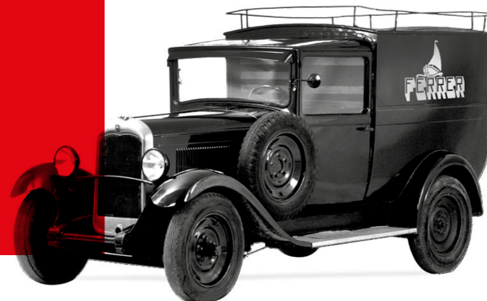
Year 1935, Ferrer's first vehicle