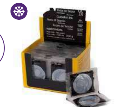
9637 Cuttlefish ink sachettes 4 un. de 4g | 1x60 un. Nero di seppia