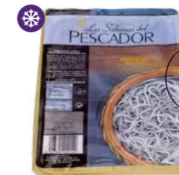
9629 Elver surimi 10x200g Surimi d'elmo