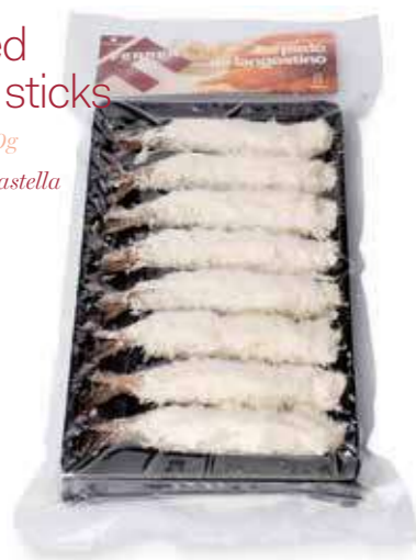
8316 Battered shrimp sticks 8 un. | 12x200g Gambero in pastella