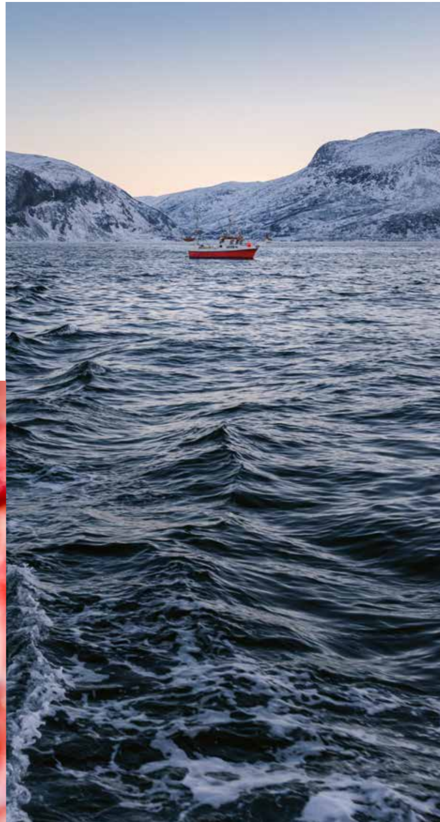
Frozen on board ship Pacific Ocean