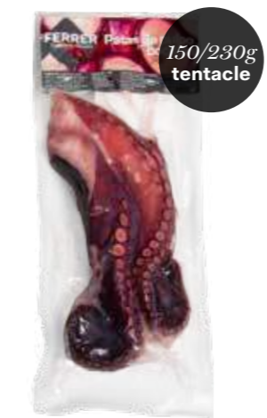
10126 Cooked octopus tentacles T-3 2 tent. | 6x300-460g/case Delizia di polpo