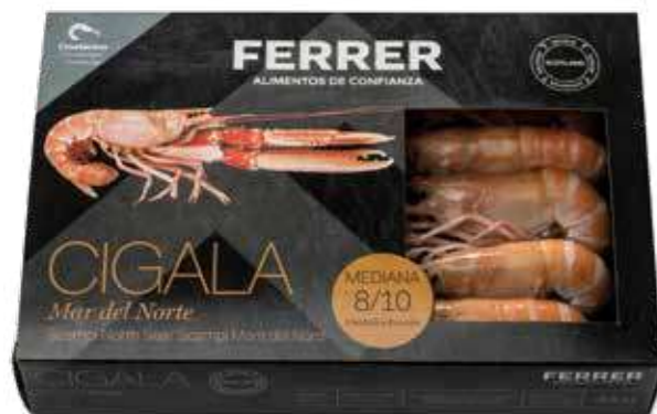
2015 Scampi mini case

8-10 un. | 12x410g | NDW: 400g Scampi mare del nord