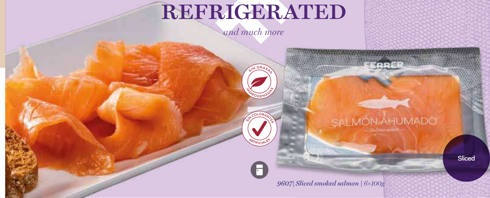
9607 | Sliced smoked salmon | 6x100g