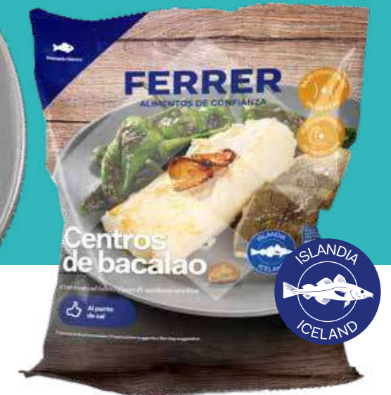
4182 Cod loins 3-5 un. | 8x625g | NDW: 500g Porzioni Baccalà