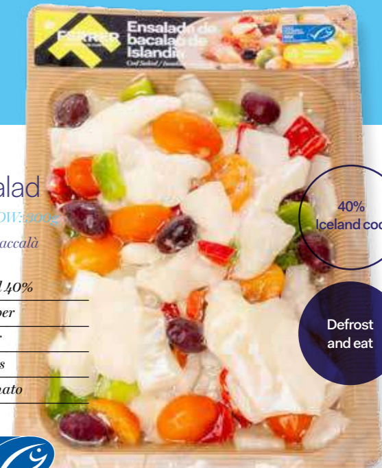
4193 Cod salad 6x300g | NDW: 300g Insalata di baccalà • Iceland cod 40% • Green pepper • Red pepper • Black olives • Cherry tomato • Onion