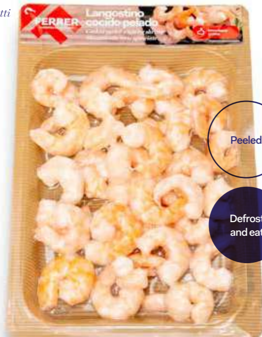
4749 Cooked king prawn tails 31-39 un. | 8x200g | NDW: 180g Gamberi cotti e sgusciati