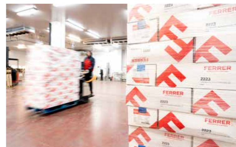
Cold storage room Vic, Barcelona