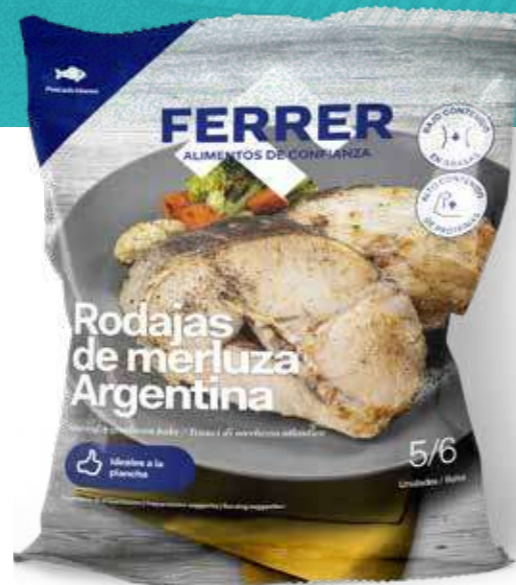
4691 Argentine hake slices 5-6 un. | 8x600g | NDW: 500g Fette di nasello argentino