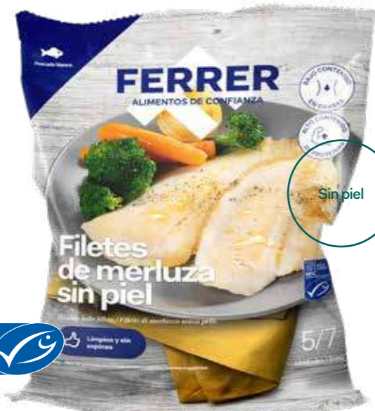
4188 Skinless cape hake fillet 5-7 un. | 8x600g | NDW: 500g Filetti di nasello senza pelle