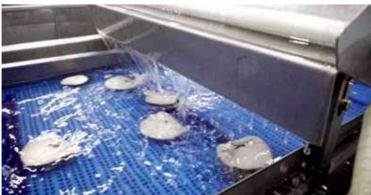
Processing frozen factory Vic, Barcelona