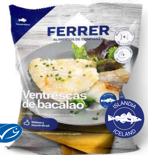
4184 Cod belly 8x550g | NDW: 500g Pancetta di merluzzo