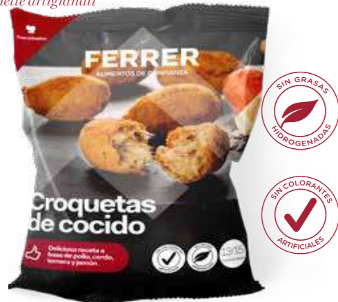
4608 Homemade "cocido" croquettes 13-15 un. | 8x500g Crocchette artigianali