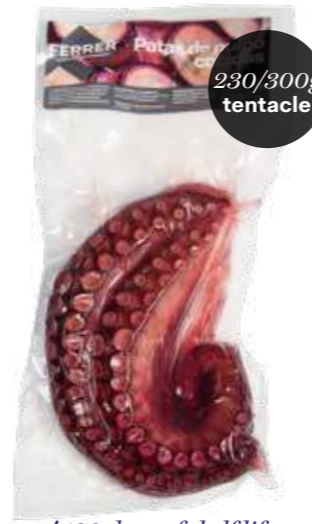
10125 Cooked octopus tentacles T-2 2 tent. | 6x460-600g/case Delizia di polpo