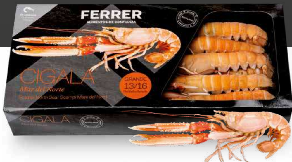
2306 Scampi North Sea

13-16 un. | 6x1kg | NDW: 800g Scampi Scampi mare del nord