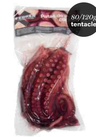
10127 Cooked octopus tentacles T-5 3 tent. | 6x240-360g/case Delizia di polpo