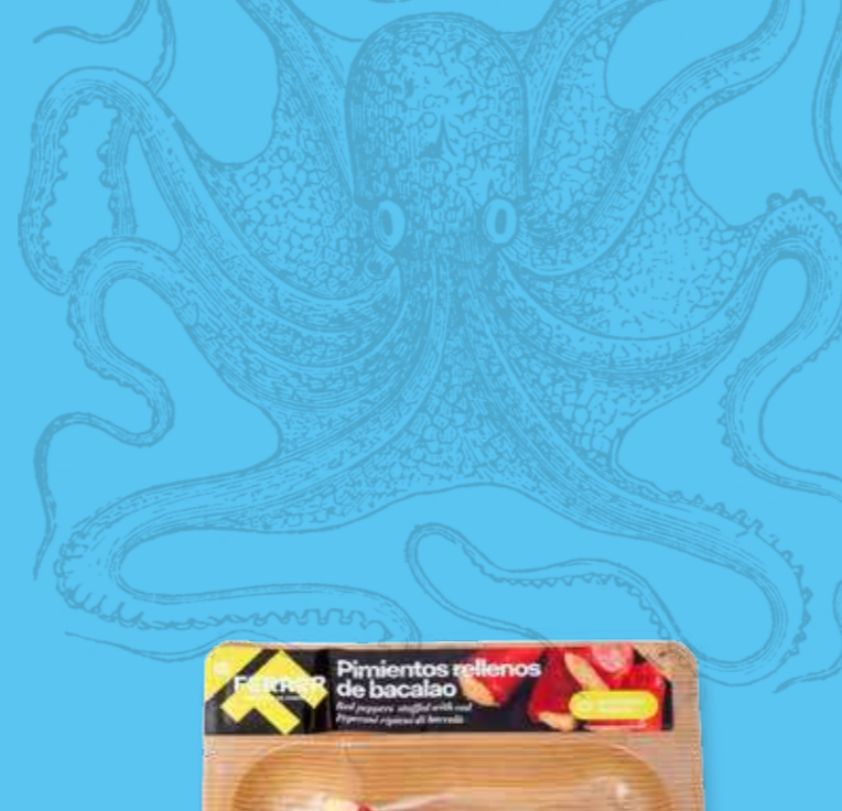
4293 Red peppers stuffed with cod With cod brandade 4-5 un. | 5x275g NDW: 275g Peperoni ripieni al baccalà