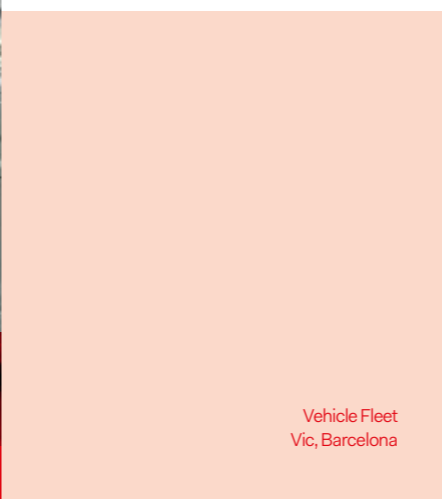
Vehicle Fleet Vic, Barcelona