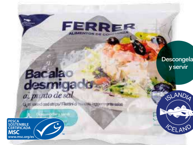
7349 Light salted cod strips 8x500g | NDW: 500g Fillettini di baccalà leggermente salati