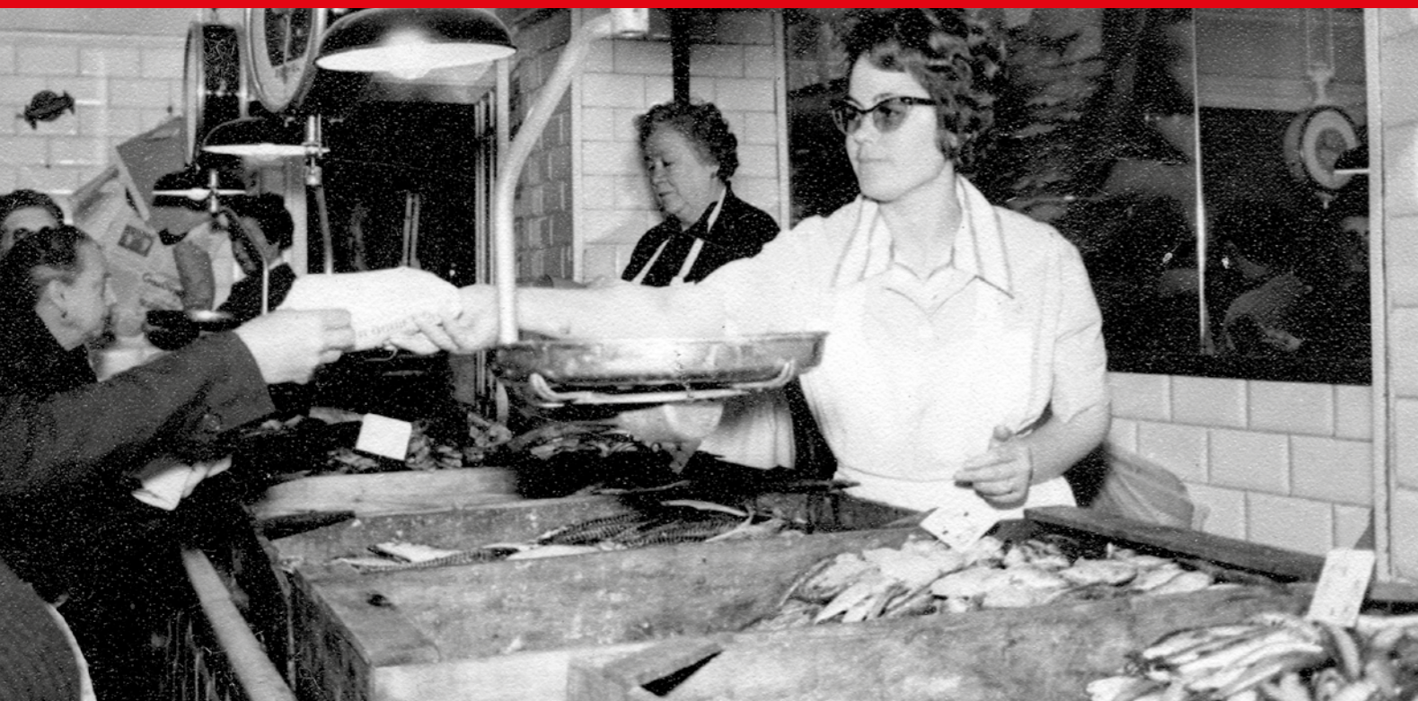
"Ca la Manela" Fish shop Vic, Barcelona Year 1961