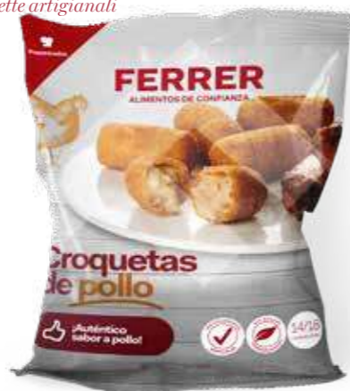
Handmade croquettes 4607 | Chicken | 14-18 un. | 8x500g 4609 | Cod | 14-18 un. | 8x500g 4610 | Ham | 14-18 un. | 8x500g Crocchette artigianali