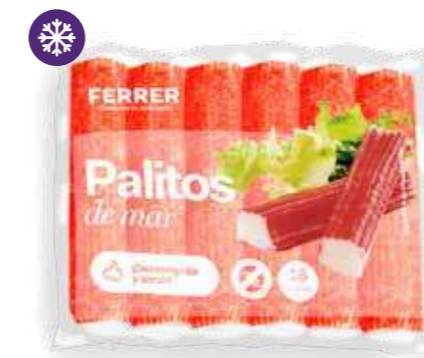
8079 Surimi crab sticks 16 un. | 24x250g | P. Esc: 240g Bastoncini di granchio surimi