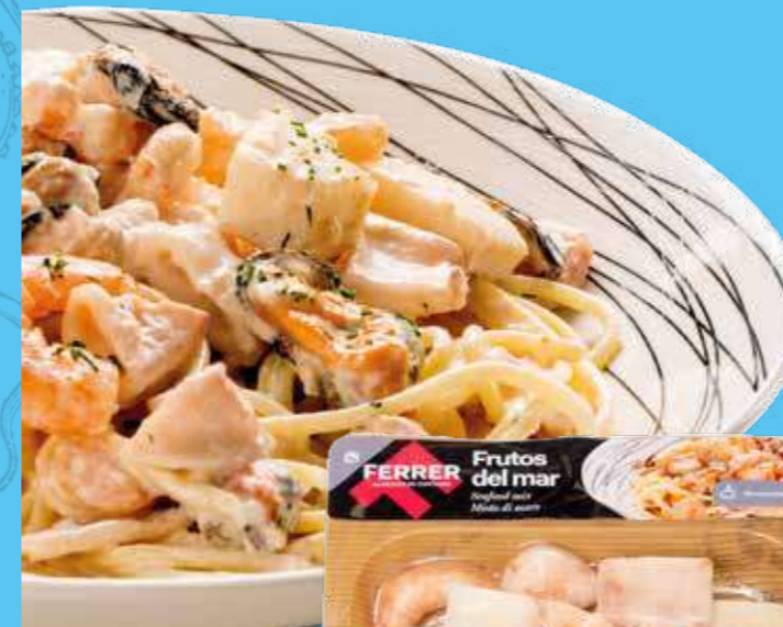
4160 Sea fruits 6x300g | NDW: 240g Frutti di mare sgusciati • Peeled prawns • Cut squid • Mussel meat • Hake dices • Giant squid dices